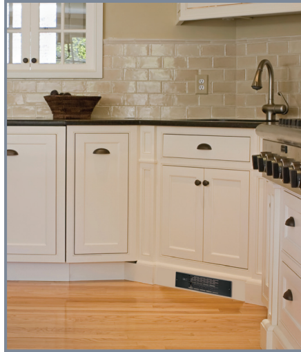
Install Hide-A-Vector4 beneath a kitchen cabinet.