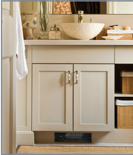
Install Hide-A-Vector4 under a bathroom vanity.