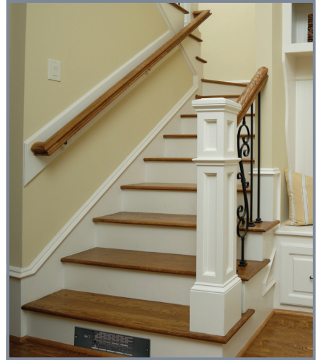
Install Hide-A-Vector4 under a stair riser.